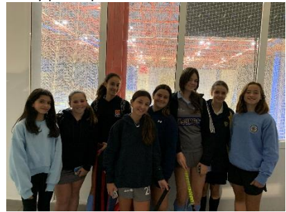
We wish them the best of luck and look forward to seeing them successfully completing the award.

Our junior members have shown great interest in taking part in this award and we are thrilled to see it launched with so many participants.